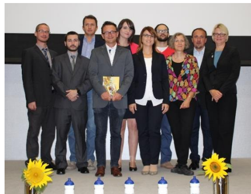
Fig. 4: The project team after the final conference

The project coordinator wants to thank all team members for their professional work and their cordial friendship in the past two years.